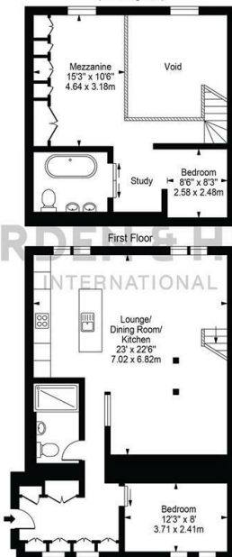
Ground Floor For Illustration Purposes Only - Not To Scale

Clock Court, Victory Road Approx. Gross Internal Area 1145 Sq Ft - 106.35 Sq M (Excluding Void)